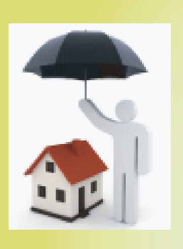
1. One Paint & Solution